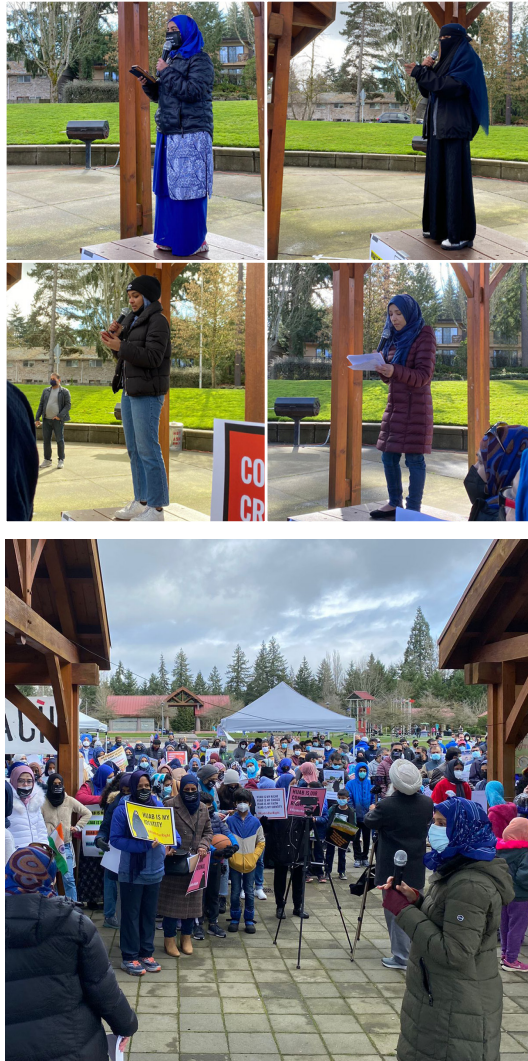
Protest against India's Hijab Bans in Feb. 2022

It is of utmost importance that we keep our fellow Muslims abroad in our thoughts and prayers, and take action by advocating locally: in protests and directly to lawmakers. Clearly, the Global War on Terror has been ongoing and intercontinental, with everlasting effects on our communities. CAIR-WA will continue to amplify and advocate for our Muslim communities abroad that are undergoing such atrocities under the guise of 'fighting terrorism'.