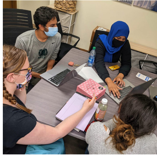
The CAIR-WA policy team prepares an election guide

CAIR WA's Civil Rights team provides free legal counseling and referrals for