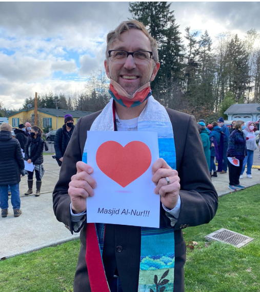
Interfaith gathering in Olympia

of Olympia by drivers who fled the scene by car. Each time, the team at CAIR-WA worked with masjid leaders, urging law enforcement to fully investigate these crimes. We sent our "Best Practices for Mosque and Community Safety" guide to over 50 mosques and Muslim organizations and held a "Responding to Masjid Attacks" educational webinar weeks after the attacks.